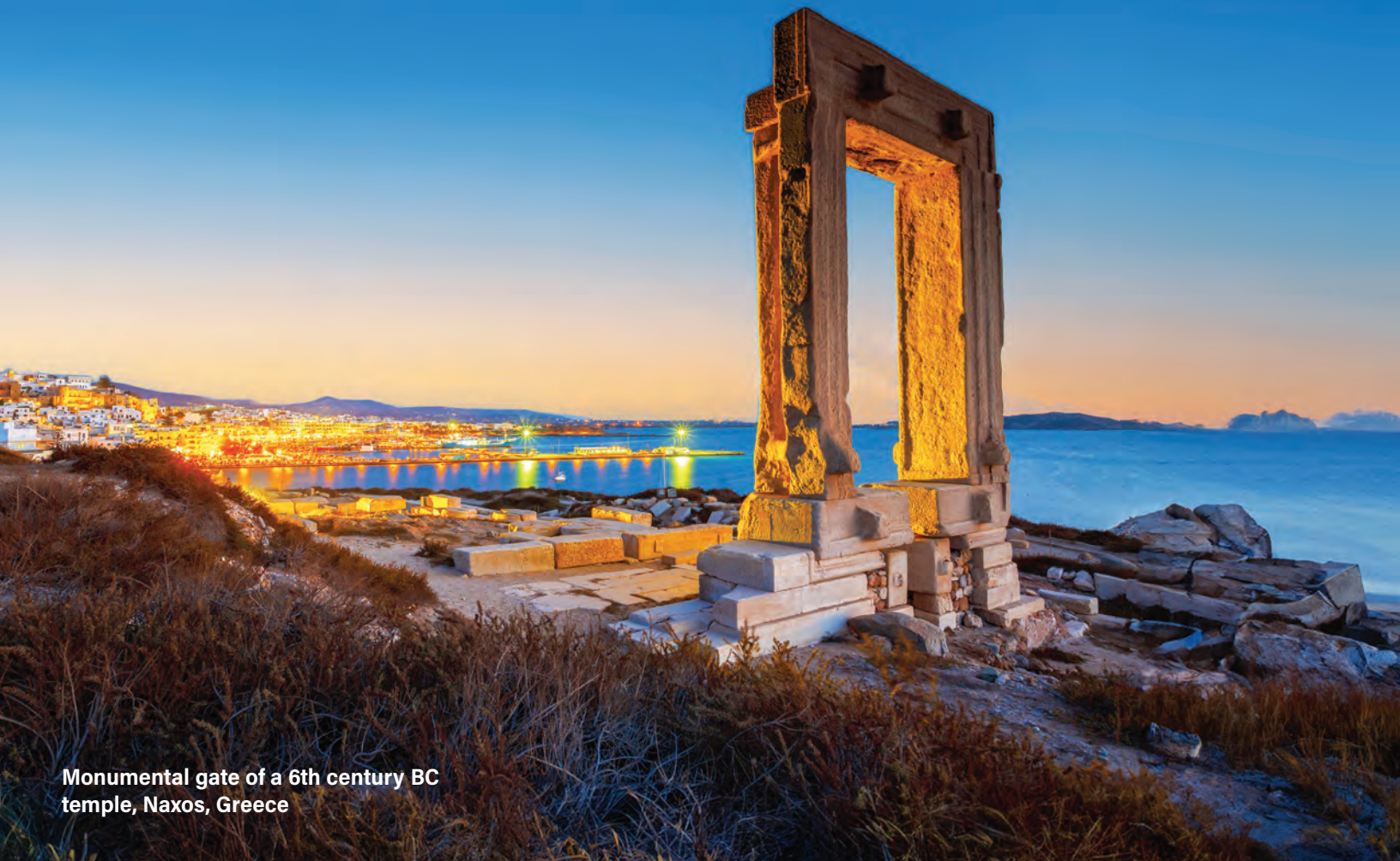
Monumental gate of a 6th century BC temple, Naxos, Greece

Aboard the New Expedition Cruise Ship DIANA