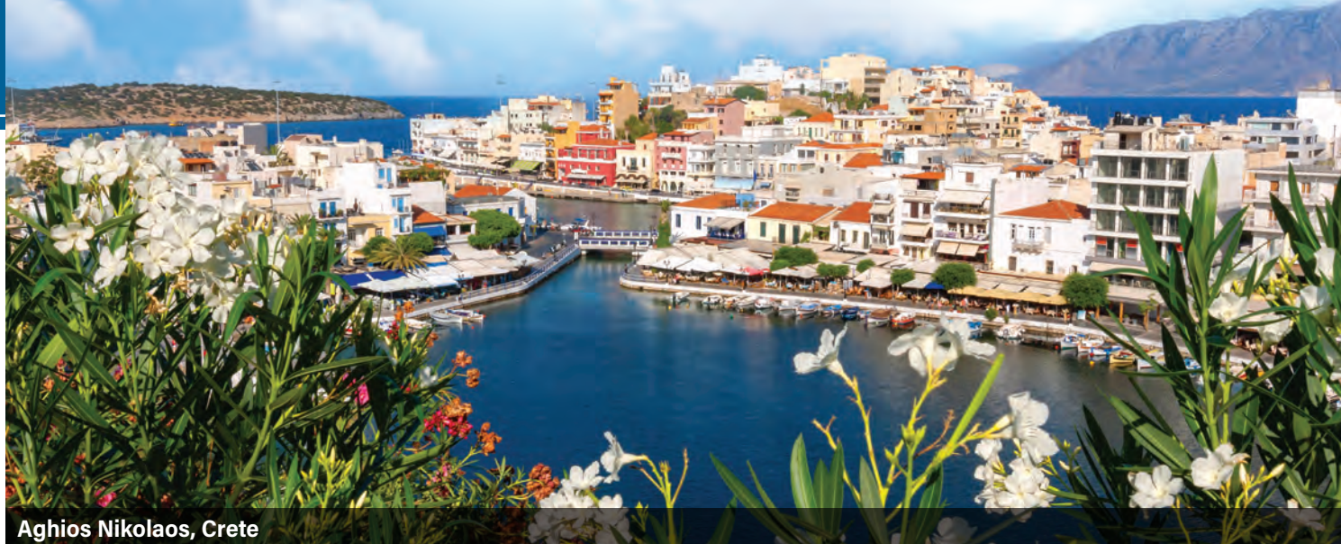
Aghios Nikolaos, Crete

to the exquisite Heraklion Museum, whose eye-opening exhibits reinforce the impression gained at Knossos of the brilliance and refinement of Minoan civilization. (B,L,D)