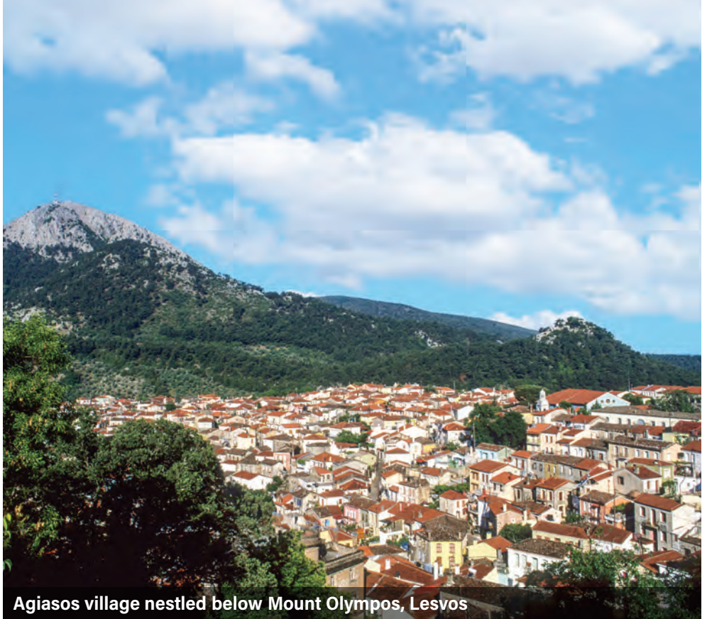
Agiasos village nestled below Mount Olympos, Lesvos