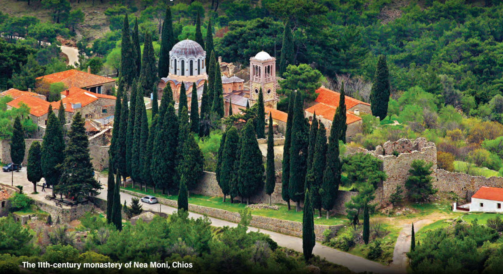
The 11th-century monastery of Nea Moni, Chios