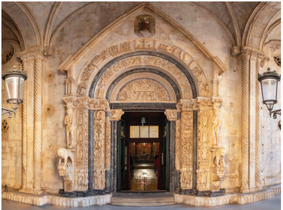
Portal of the Cathedral of St. Lawrence, Trogir