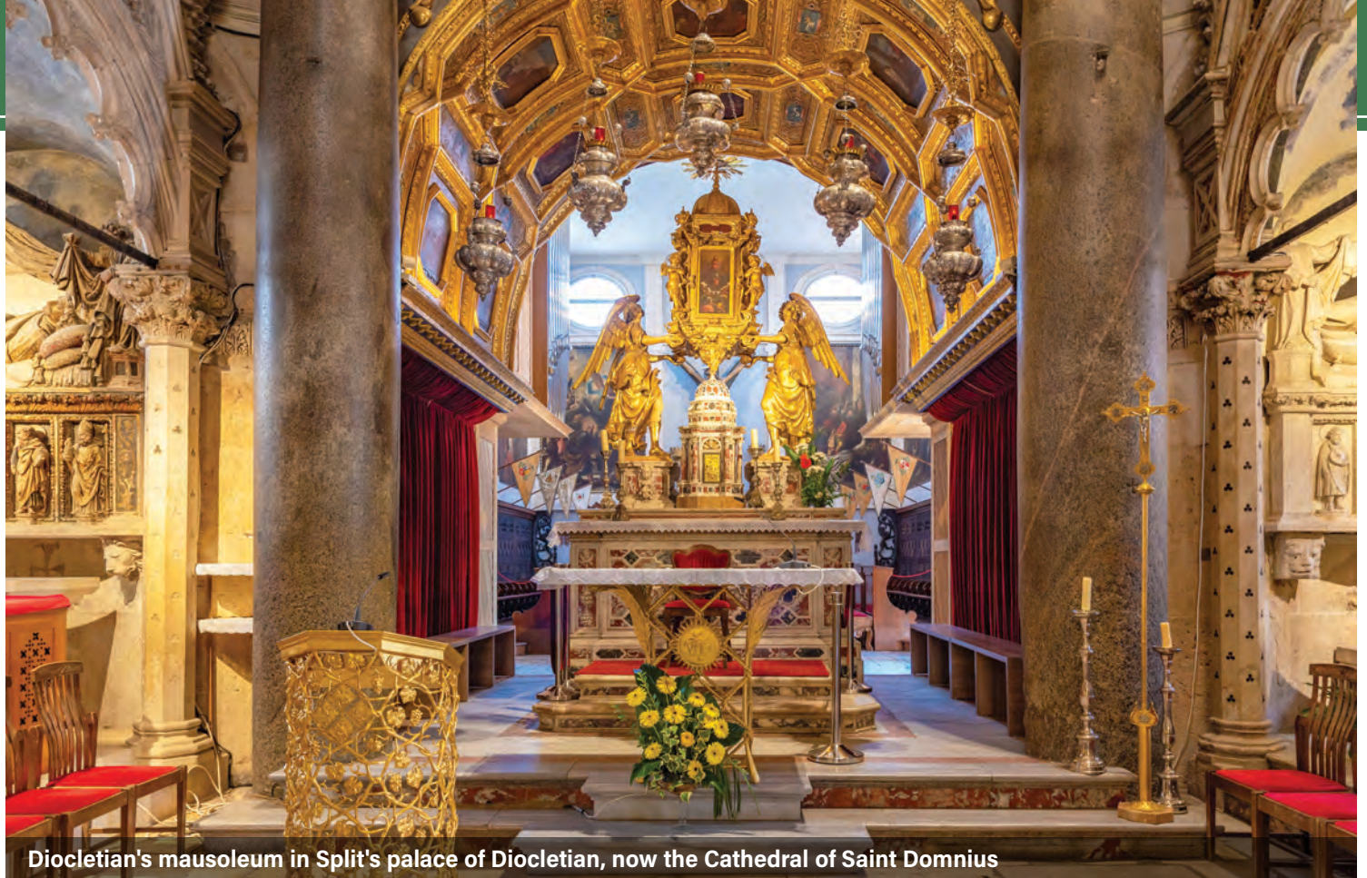
Diocletian's mausoleum in Split's palace of Diocletian, now the Cathedral of Saint Domnius