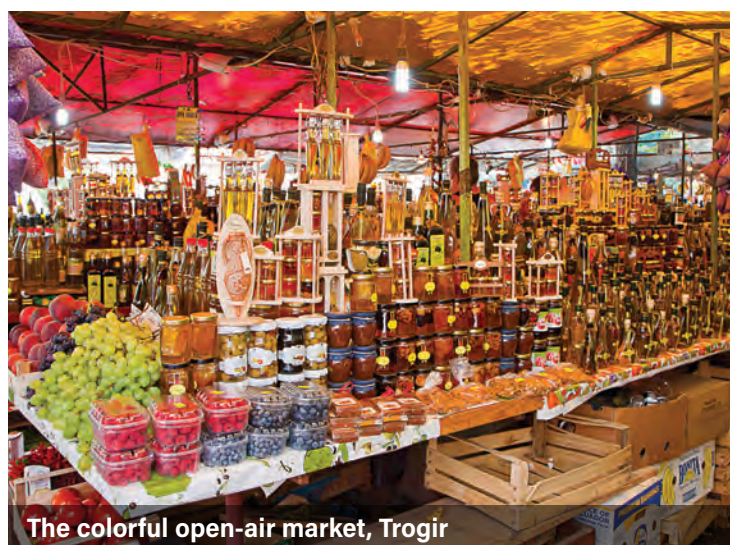
The colorful open-air market, Trogir