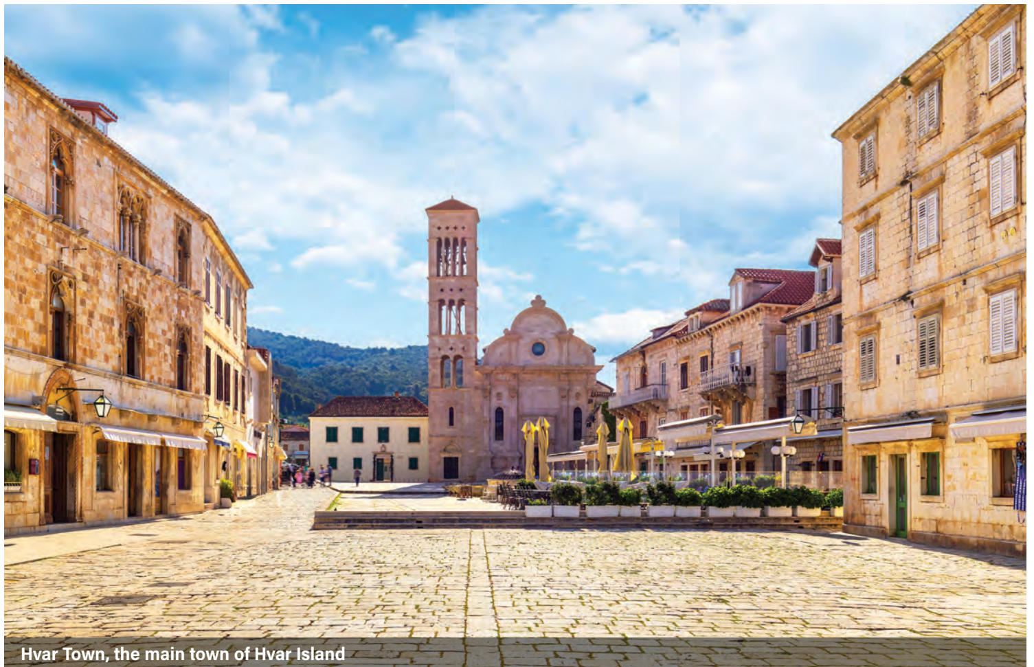
Hvar Town, the main town of Hvar Island