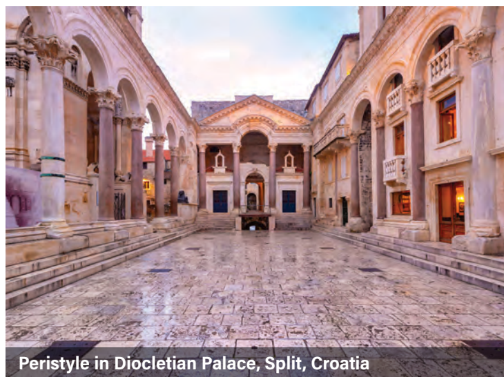
Peristyle in Diocletian Palace, Split, Croatia