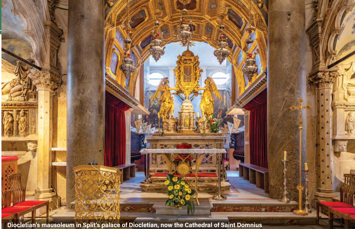
Diocletian's mausoleum in Split's palace of Diocletian, now the Cathedral of Saint Domnius