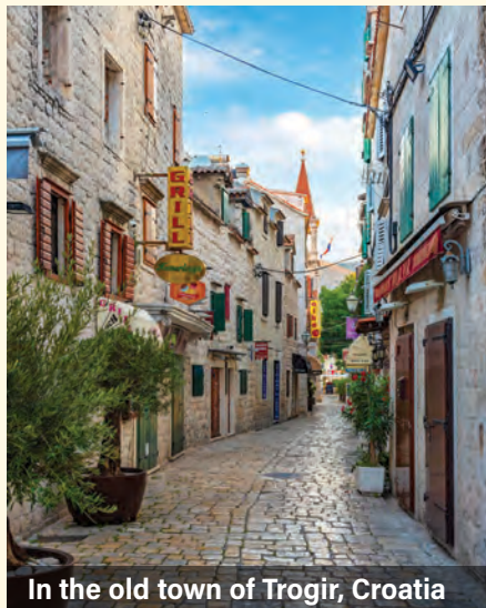
In the old town of Trogir, Croatia

NOT INCLUDED: International airfare; travel insurance; expenses of a personal nature; any items not mentioned in the Itinerary and the Program Inclusions.