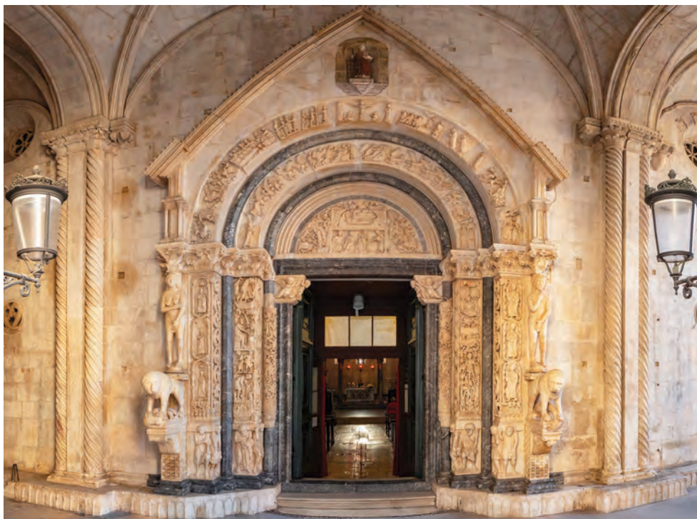
Portal of the Cathedral of St. Lawrence, Trogir