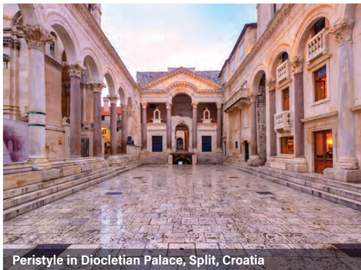
Peristyle in Diocletian Palace, Split, Croatia