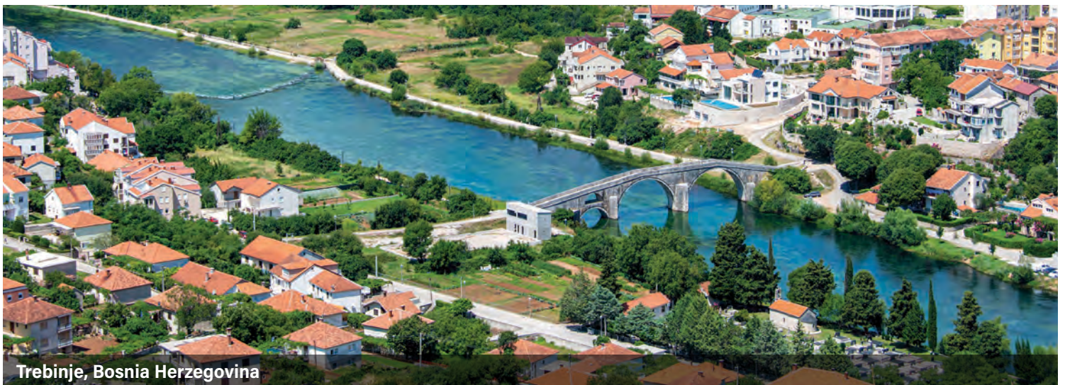
Trebinje, Bosnia Herzegovina

Transfer to the airport for the return flight home. (B)