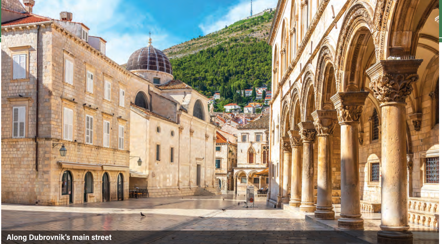
Along Dubrovnik's main street