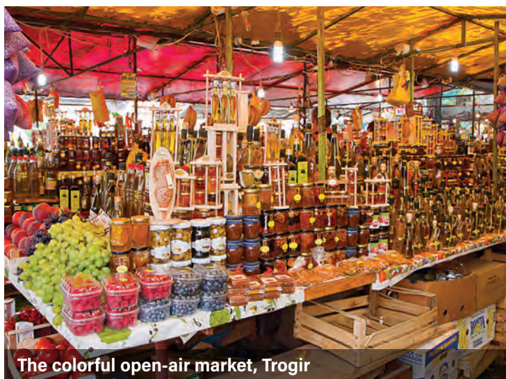
The colorful open-air market, Trogir

In the morning, drive to Dubrovnik. Stop on the way at Mali Ston, an attractive old town enclosed within its fortifications. The town is famous for its oysters, which we will enjoy for lunch, along with other delicacies. After lunch, continue to Dubrovnik and check in at the Hotel Excelsior (or similar), conveniently located at the edge of the Old Town. Dinner will be served at a local restaurant. (B, L, D)