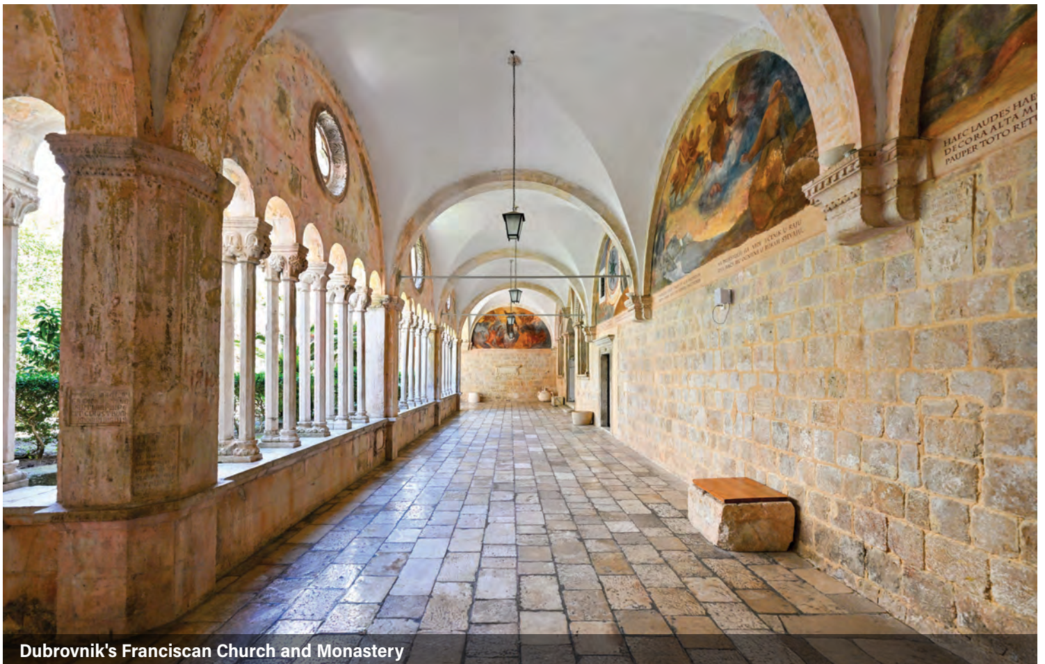
Dubrovnik's Franciscan Church and Monastery