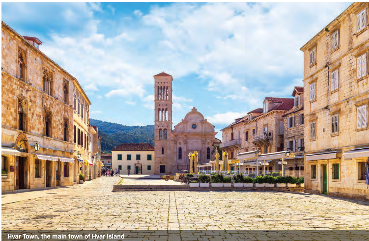
Hvar Town, the main town of Hvar Island