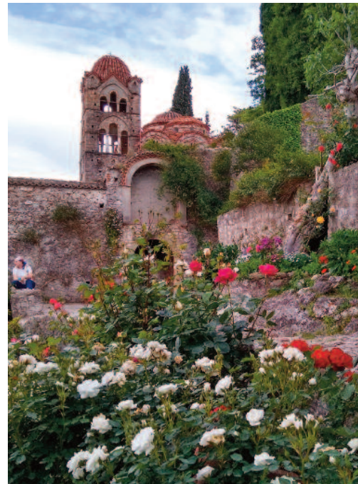
In medieval Mistra, Peloponnese, Greece

Although Mycenaean Greeks had a presence in southern Italy during the second millennium BC, it was shortly after 800 BC that Greeks began to settle in Italy's southern shores. The cities they founded, (twenty two major settlements were established), grew in wealth and stature, becoming important centers of culture and learning. This part of Italy was known as Magna Graecia, "Greater Greece." Leave the hotel in the morning to explore Metapontum, founded in the 7th century BC by settlers from Pylos in the western Peloponnese. The Doric temple known as the Tavole Palatine is one of the best preserved monuments of Magna Graecia. Continue to Taranto, the ancient Taras. Founded by Spartans in 708 BC, Taras became one of the most powerful cities of Magna Graecia. Today, Taranto is an important commercial port city. Tour the town, including the National Archaeological Museum, which houses one of the largest collections of antiquities in Italy. Meals: B, L