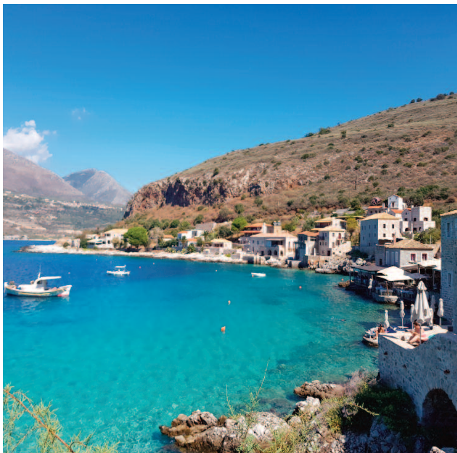
The seaside village of Limeni, Mani, Peloponnese, Greece

Or download a PDF at skeptical.com/Greece2021