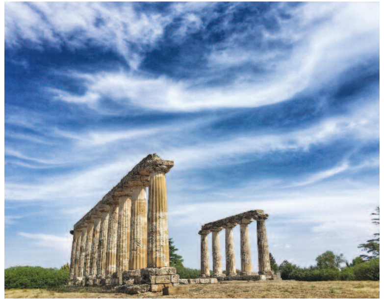
Tavole Palatine, Metapontum, Puglia, Italy

Thalassa Journeys was established by the principals and managers of Travel Dynamics, the company that 50 years ago pioneered the concept of educational travel for America's educational and cultural institutions. The belief that travel is primarily a learning experience forms the core principle of Thalassa Journeys. We bring an unrivaled depth of experience to make your journey with us meaningful, unique and seamless. We will take you not only to marvelous places, but we will also bridge the past with the present, illuminate the ancient sites we explore – what they were, how they came to be, and why they matter to us – make them come alive, and enrich your mind and inspire your senses. We are steeped in the culture of our destinations and know the secret places often overlooked by the guide-books. We welcome you to the ever fascinating world of Thalassa Journeys.