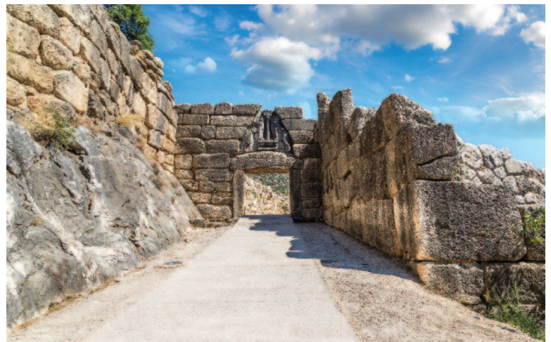
The Lion Gate in Mycenae, Peloponnese, Greece