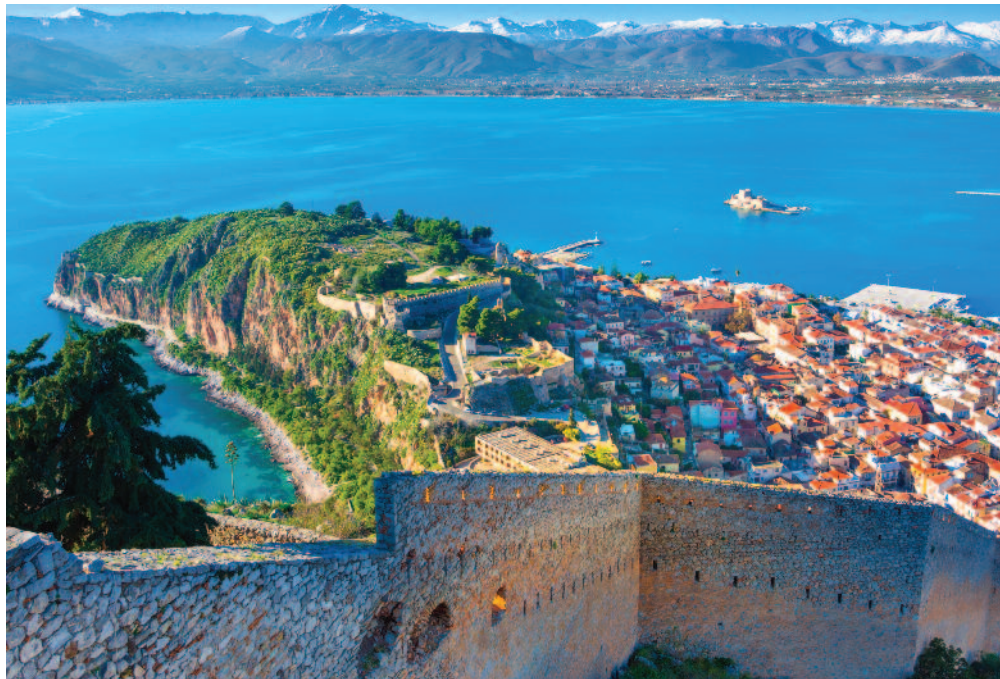
Nafplion, Peloponnese, Greece

the morning displays artifacts from excavations in Sparta and nearby sites. Continue to storied Mani, which offers some of the most distinctive landscape and architecture in Greece. Visit the caves of Diros, huge chambers with evidence of occupation in the prehistoric period, filled with impressive stalactites and stalagmites. After lunch, explore some of Mani's villages with their characteristic tower houses.