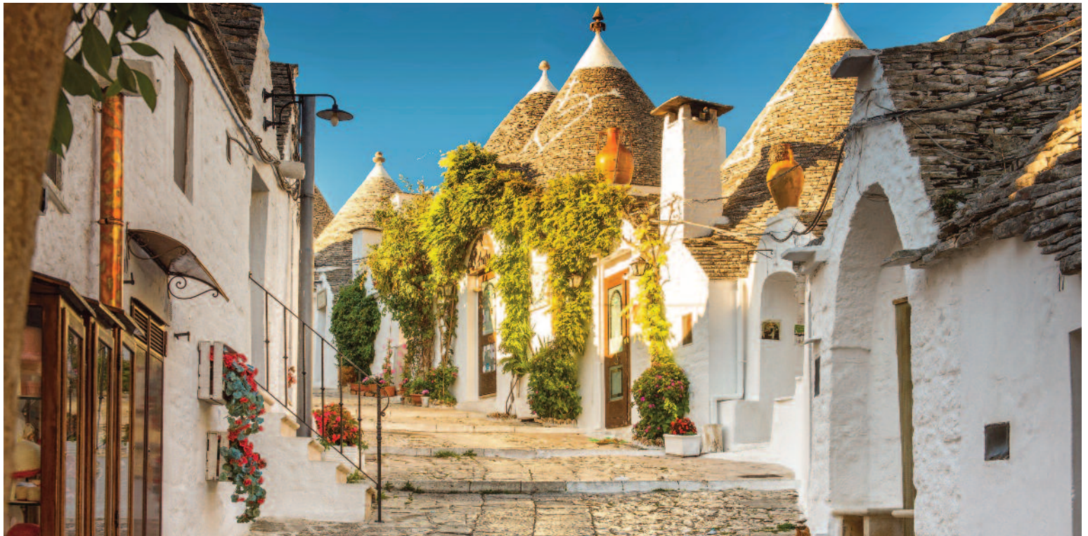
The trulli of Alberobello, Puglia, Italy