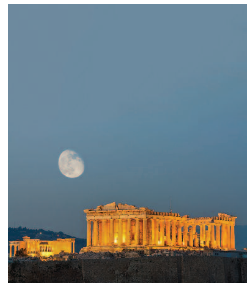
The illuminated Parthenon on the Athenian Acropolis

Very little remains of ancient Sparta, but the Archaeological Museum, which we will visit in