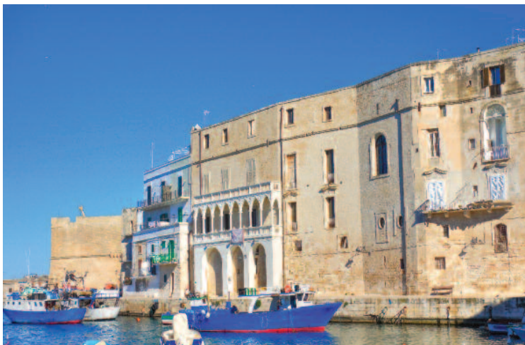
Monopoli, Puglia, Italy