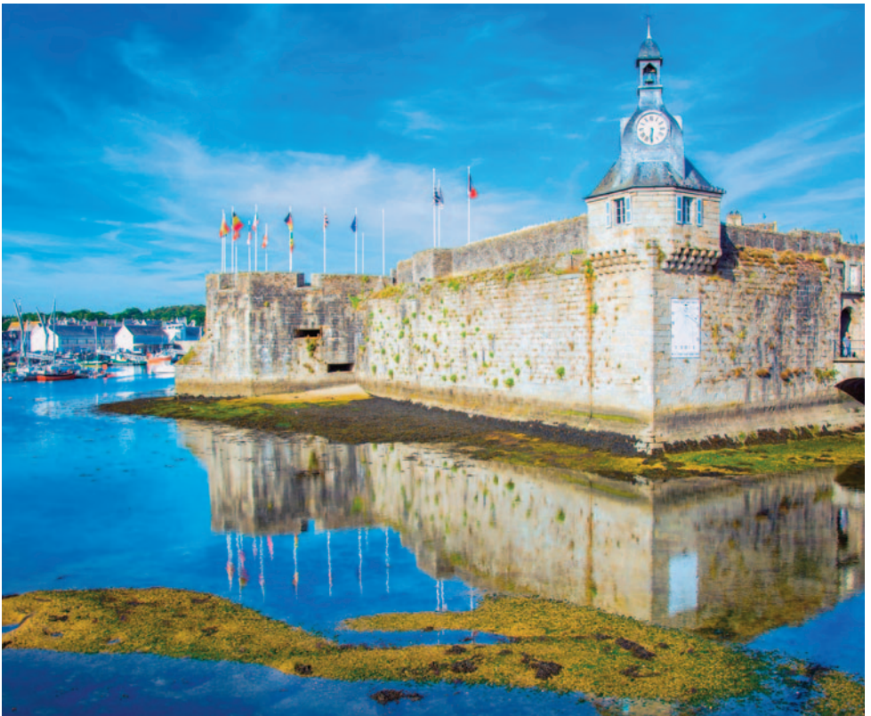
Concarneau en Bretagne, France

NOT INCLUDED: International airfare; travel insurance; expenses of a personal nature; any items not mentioned in the itinerary or the above inclusions.