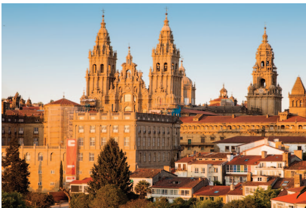
Catedral de Santiago de Compostela, Spain