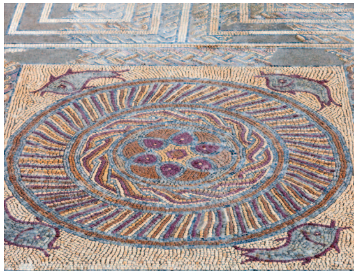
Mosaic from Portugal's ancient Roman site of Conimbriga