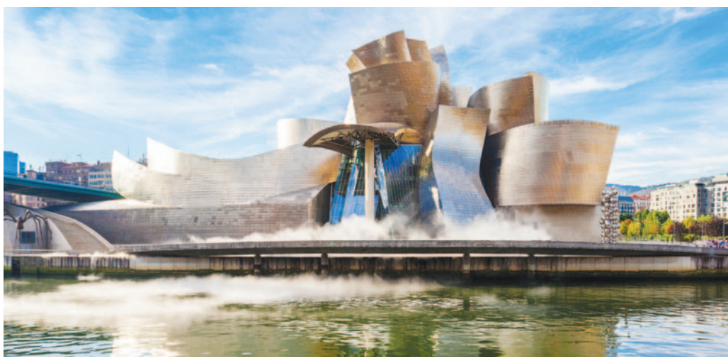
The Guggenheim Museum, Bilbao