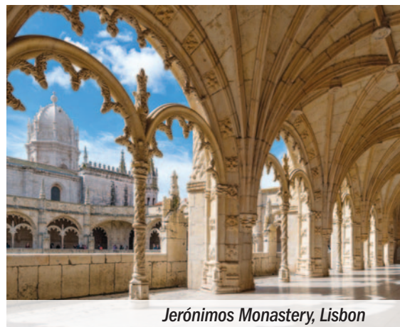
Jerónimos Monastery, Lisbon