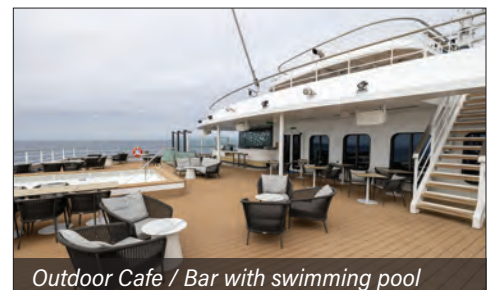
Outdoor Café / Bar with swimming pool

Built in Finland, and launched in December 2021, Swan Hellenic's Minerva is a new-generation expedition cruise ship. Although at 10,250 tons the ship is large enough to accommodate more than 250 passengers, Minerva accommodates a maximum of 152 guests in 76 spacious staterooms and balcony suites. The low guest density results in one of the most generous indoor and outdoor space-to-guest ratios among cruise ships.