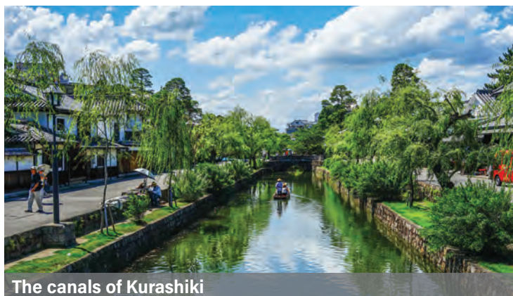
The canals of Kurashiki

Made entirely of pine, Matsue Castle was built in 1611, and, with a partial reconstruction in 1692, never having been ransacked or burned, remains as it was in the late 17th-century. Explore the five-story façade, including the uppermost floor, which offers views of the city, Lake Shinji, and the distant mountains. In the afternoon, we visit the Adachi Museum of Art and its gardens. The Museum houses numerous works by the great masters of modern Japanese art – Yokoyama Taikan, Takeuchi Seiho, Uemura Shoen, and Ito Shinsui, among others. Most of the works were selected by Adachi Zenko (1899-1990), the museum's founder, who favored a wide and eclectic range of styles. (B,L,D)