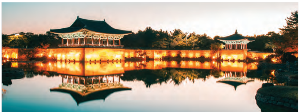
Gyeongju Historic Area, South Korea