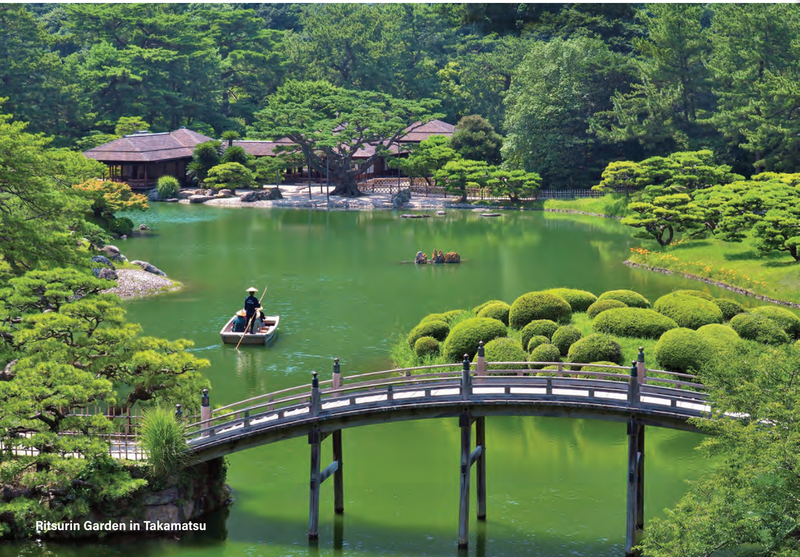
Ritsurin Garden in Takamatsu