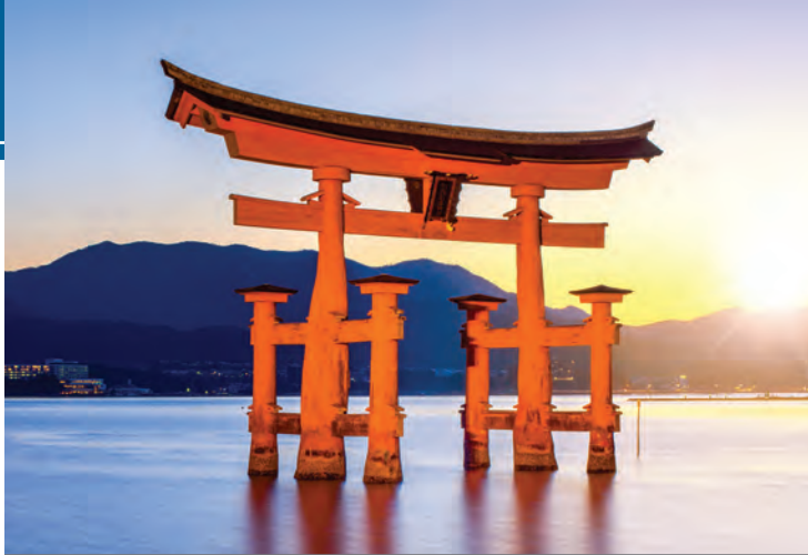
Itsukushima Shrine in Miyajima