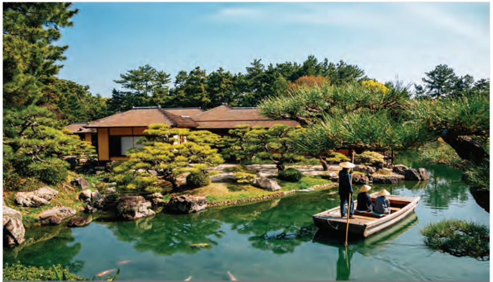
Traditional garden, Takamatsu