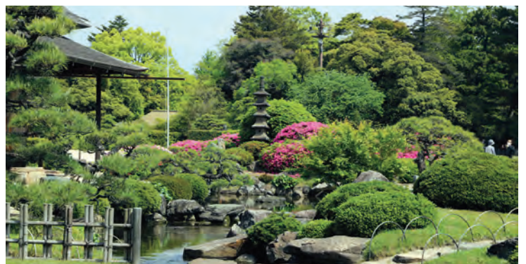
Korakuen garden, Okayama

After breakfast aboard, transfer to the Osaka airport for flights homeward. (B)