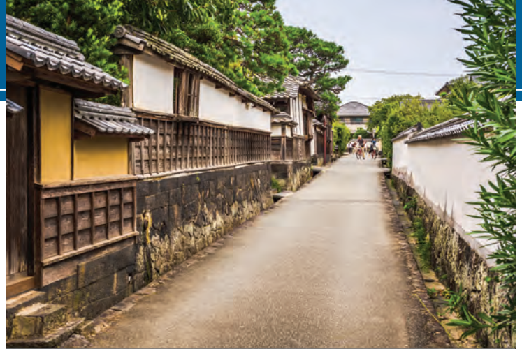
Hagi, Old Town